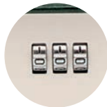
3 Digit Combination Lock