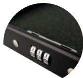
3 Digit Combination Lock