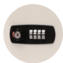
4 Digit Combination Lock