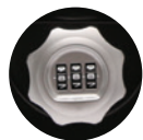
3 Digit Combination Lock SILVER