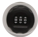
3 Digit Combination Lock BLACK