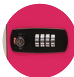
4 Digit Combination Lock